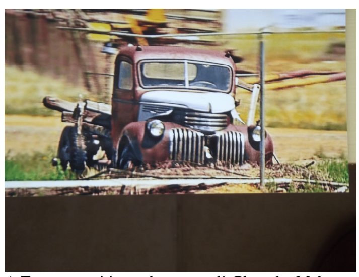
A Treasure waiting to be restored! while travelling by train in USA 2012

IF You belong to another Motoring or Historical Society and wish to advertise the event please contact the Newsletter Editor.