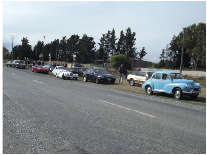
The Cars lined up in Jones Road ready for our outing to Homebush.